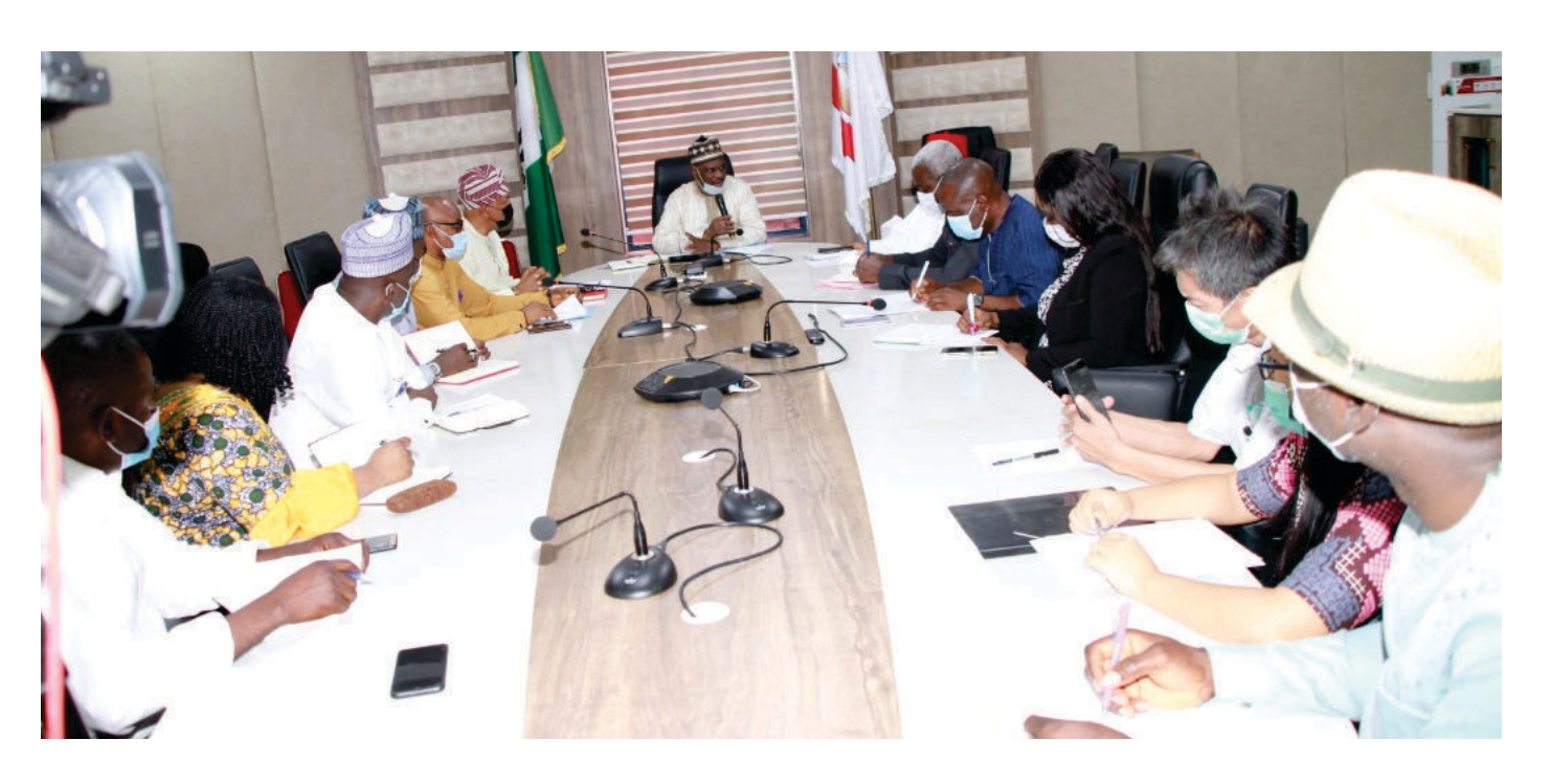
Cross section of participants

I'm not happy with what is going on in Ebonyi State regarding the project as the contractors are doing practically nothing. The one that should be building the tower is playing politics with us. If they are not working, they should leave the site.