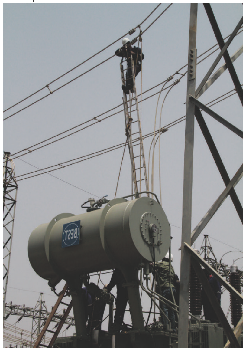
TCN engineers installing the new 60MVA power transformer at Kubwa Substation

The management of TCN is committed to improving the national electricity grid as it continues to diligently implement its grid expansion programme with projects which are at various stages of implementation, from the reconductoring of the Ikeja West-Sakete Transmission Line to reinforcing the Ugwuaji to Apir Transmission Line, among other numerous projects spread across the nation. TCN will continue to work towards its goal of putting in place a standard and robust transmission grid.