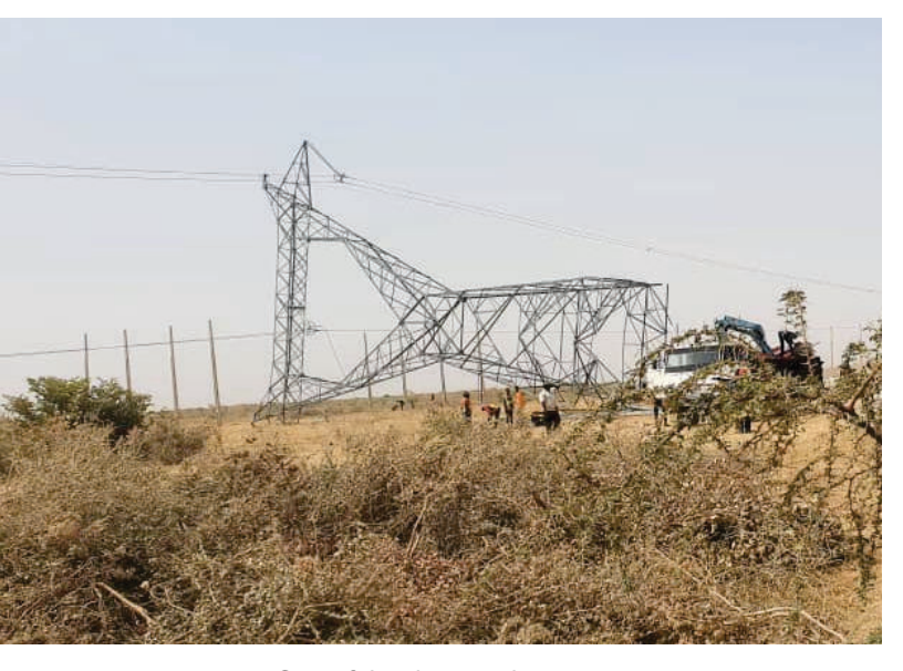
One of the damaged towers