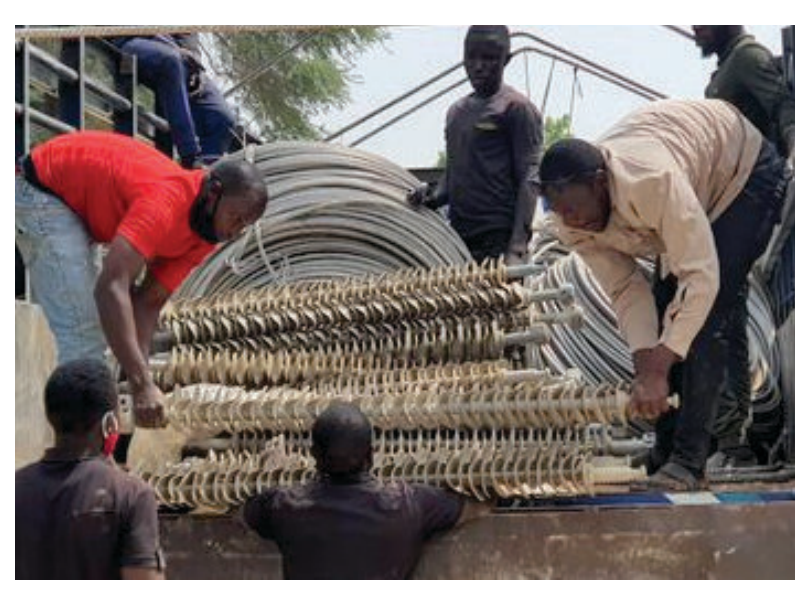
Offloading of insulators and cables

Though the permanent reconstruction work will take some time to complete, the by-pass is estimated to be completed within two weeks. Materials, workers and combined team of security personnel required at the site to facilitate progress of work have been deployed.