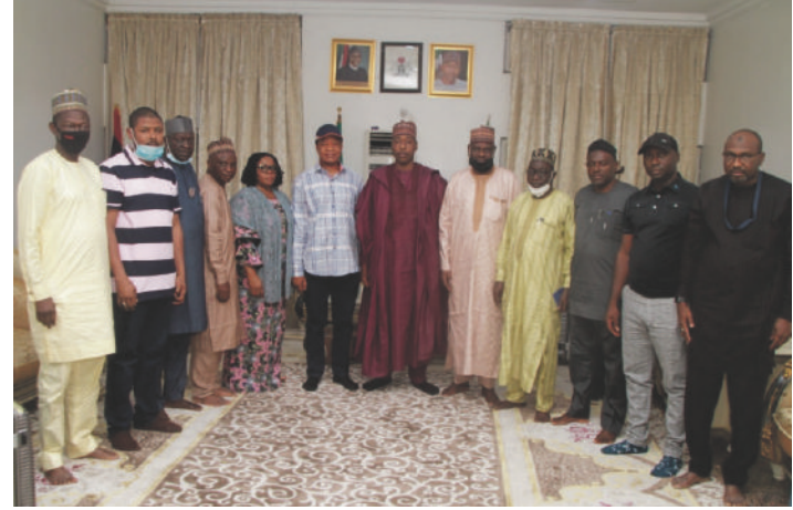
Ag. MD/CEO, TCN, MD Yola DisCo, ED TCN -TSP and TCN Management team, visit the Executive Governor of Borno State, to brief him on efforts by TCN to rebuild the damaged towers in his state and to request additional assistance in terms of security for TCN Engineers.