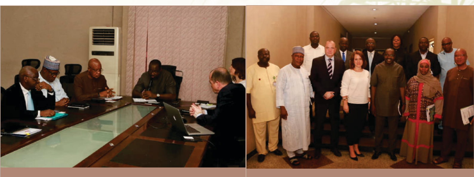
(Left), TCN Management team, (Right), and representative of Finnish Ambassador and chairman of Provendia Africa

At the end of the presentation, Provendia Africa