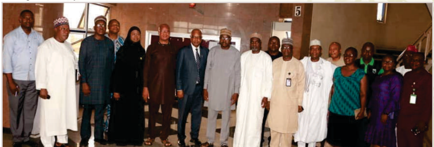
A group photograph of particpants after the meeting

According to him, TCN is focused on delivering a smart transmission grid, adding that the organization had secured the sum of $1.6 billion dollars from multilateral donor agencies for the implementation of its Transmission, Rehabilitation and Expansion Programme (TREP).