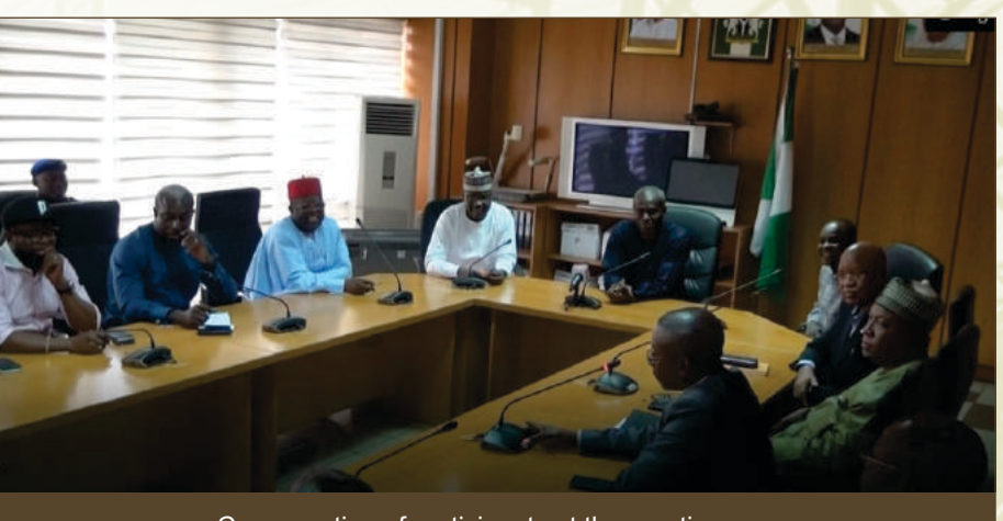
Cross section of participants at the meeting

Mr. Umahi further explained that presently, the state uses about 3MW of power for street lights and other facilities within the state, powered by a generator and that it is a challenge and very expensive to maintain.