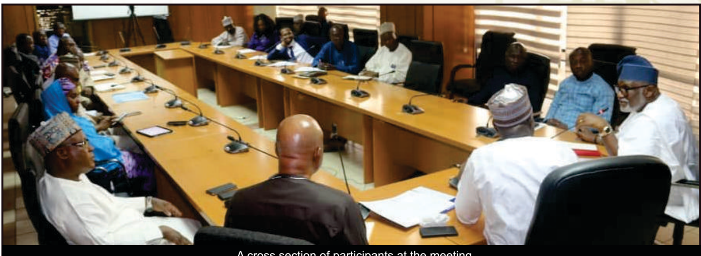
A cross section of participants at the meeting

The MD disclosed that TCN has commenced the installation of two brand new 330kV substations at Owo and Okitikpukpa and that on completion, these would improve supply in the state. TCN is also upgrading to quad line the transmission line from Omotosho plant, as well as constructing a new 330kV substation in Akure which when completed would also boost supply in Ondo State.