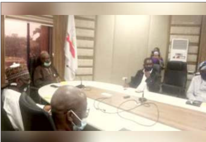
Ag. MD/CEO, TCN Management team and NUEE Executives