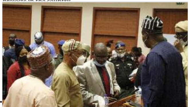
L-R: ED (ISO), ED (TSP), Ag. MD/CEO TCN & Chairman Senate Committee on Power

The TCN Management drew attention to insufficiency in gas supply and noted that this has been a major hindrance to power generation and consequently transmission and distribution of energy, and requested the committee's intervention in gas supply as well as the completion of ongoing hydro plants projects in the country.