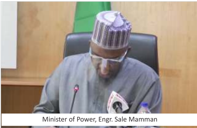
Minister of Power, Engr. Sale Mamman