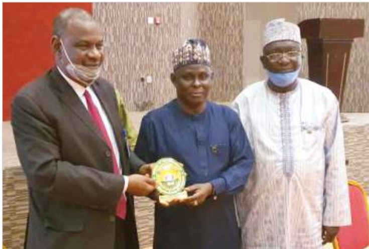
LR: Ag. MD/CEO TCN, President NSE and President COREN