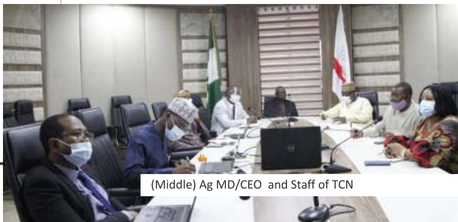
(Middle) Ag MD/CEO and Staff of TCN