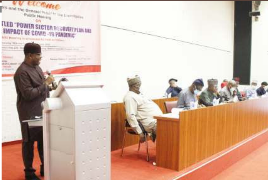
L-R: Market Operator and Members of the Senate Committee on Power

...As stakeholders call for separation of MO, ISO from TSP