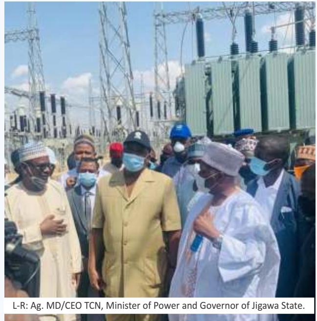
L-R: Ag. MD/CEO TCN, Minister of Power and Governor of Jigawa State.

"I can tell you that the impact of the pandemic is huge in the power sector. However, we are working in tandem with the Federal Government to restart the economy and since the interstate roads have been reopened, I direct all contractors handling power projects to return to their sites and work assiduously to make up for lost timelines caused by the