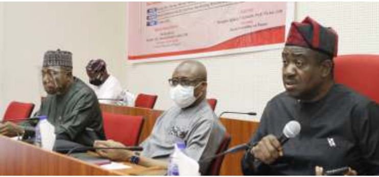
R: Chairman Senate Committee on Power, Sen. Gabriel Suswan

The Senate Committee on Power led by the Chairman, Senator Gabriel Suswan, have promised maximum support to finding a lasting solution to epileptic service delivery in the Nigerian Electricity Supply Industry (NESI).