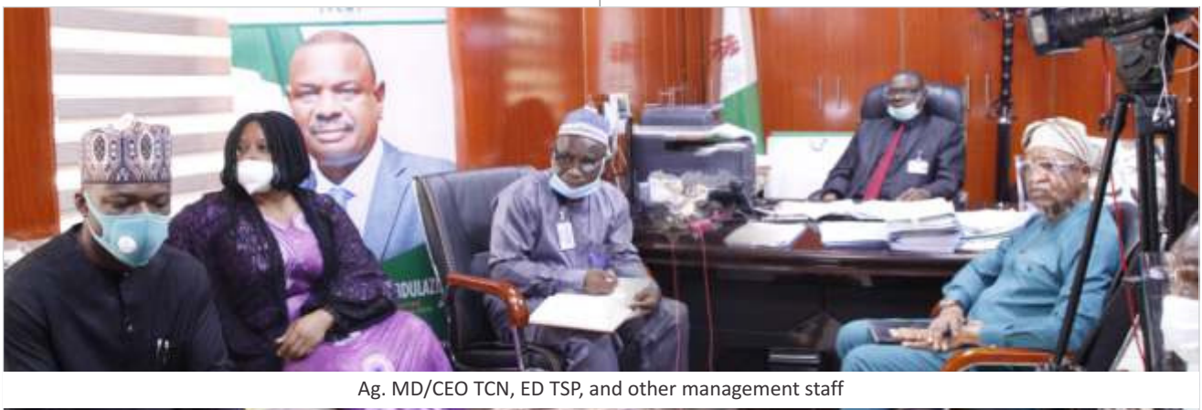
Ag. MD/CEO TCN, ED TSP, and other management staff