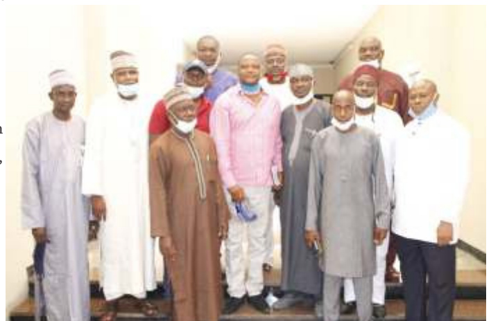
Executives of SSAEC TCN Branch

He enjoined SSEAC TCN Branch and National to come together in unity so as to bring about peaceful co-existence in the company. There is need for unity.